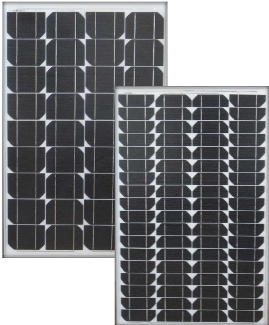
M5 Series: Monocrystalline modules